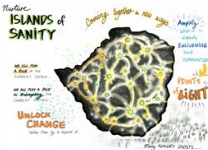
Day 2 graphic harvest image

Organised as a hybrid online and onsite format using Zoom, Facebook Streaming, Sli.do and over 25 groups across the country meeting in groups ranging from 15 to a maximum of 50 people, this year's edition truly showed us how a new level of self-organizing and opportunities for even greater inclusion and participation can be achieved, in spite of great logistical challenges. The plenary sessions and WorldCafe-style discussions received massive participation and input from the communities and on-site gatherings with a rich harvest of ideas and contributions, that were shared through the Zoom, Facebook and Sli.do platforms and captured in graphic harvests each day by artist Sonja Niederhumer (images above and below).