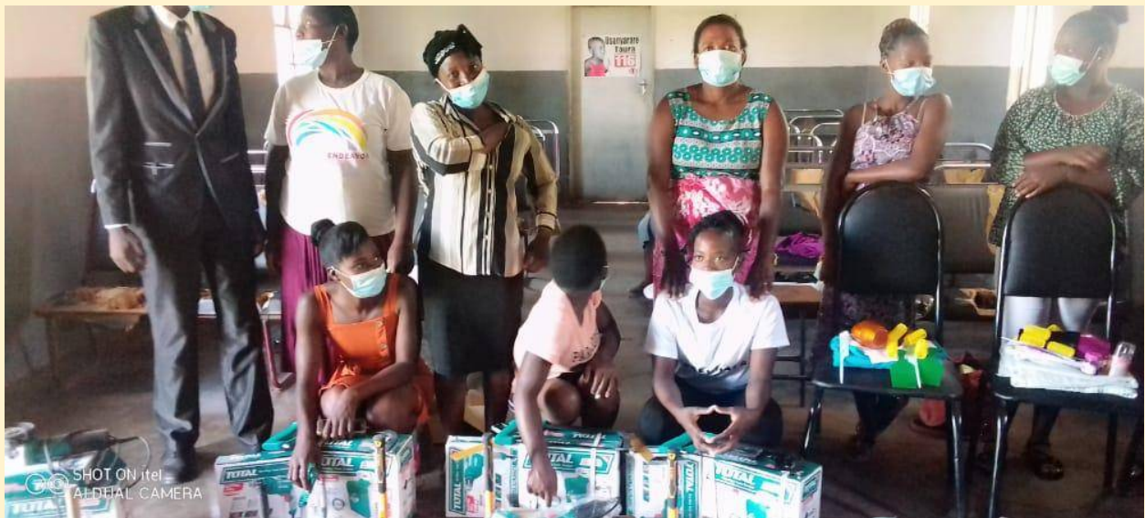
A graduation/ handover ceremony in Arcturus after months of practical training in Welding

At the close of 2020, the Arcturus Fellows held a 4 day Go Deep Game process in their community and the outcome was a collective vision to use the available skills and resources in the community to build the capacity of the youth therefore enabling them to fend for themselves as well as establishing systems that support easy transfer of this knowledge from the experts